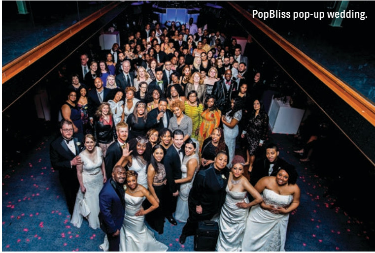
PopBliss pop-up wedding.